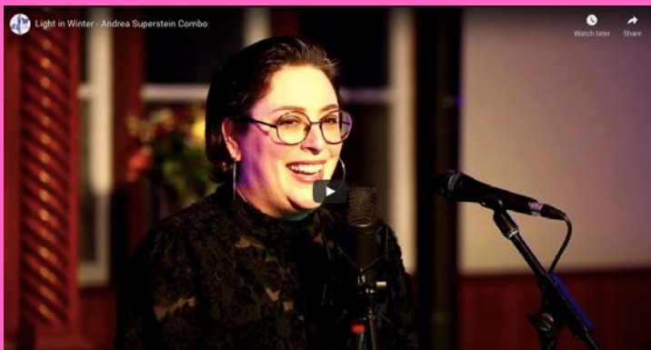
Light in Winter 2/13/2021 (LIVESTREAM CONCERT)