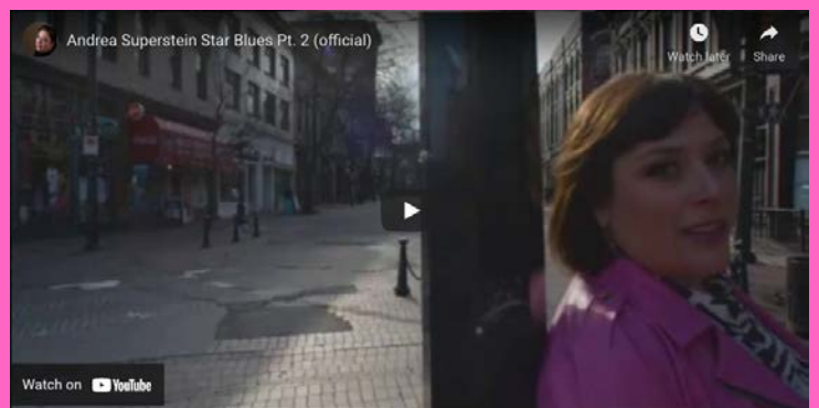
Star Blues Pt. 2 (OFFICIAL VIDEO)