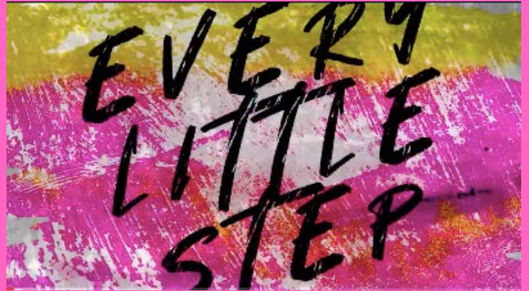
Every Little Step (OFFICIAL VIDEO)