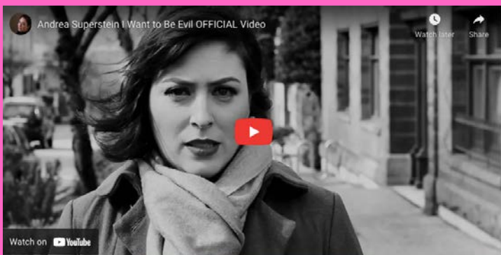
I Want To Be Evil (OFFICIAL VIDEO)