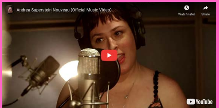
Nouveau (OFFICIAL VIDEO)