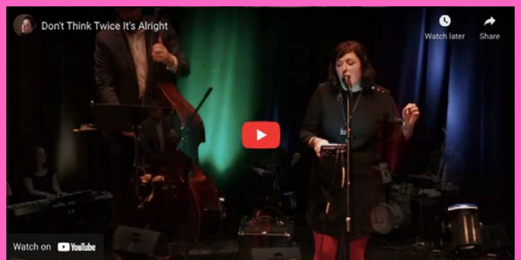
Don't Think Twice It's Alright (LIVE PERFORMANCE)